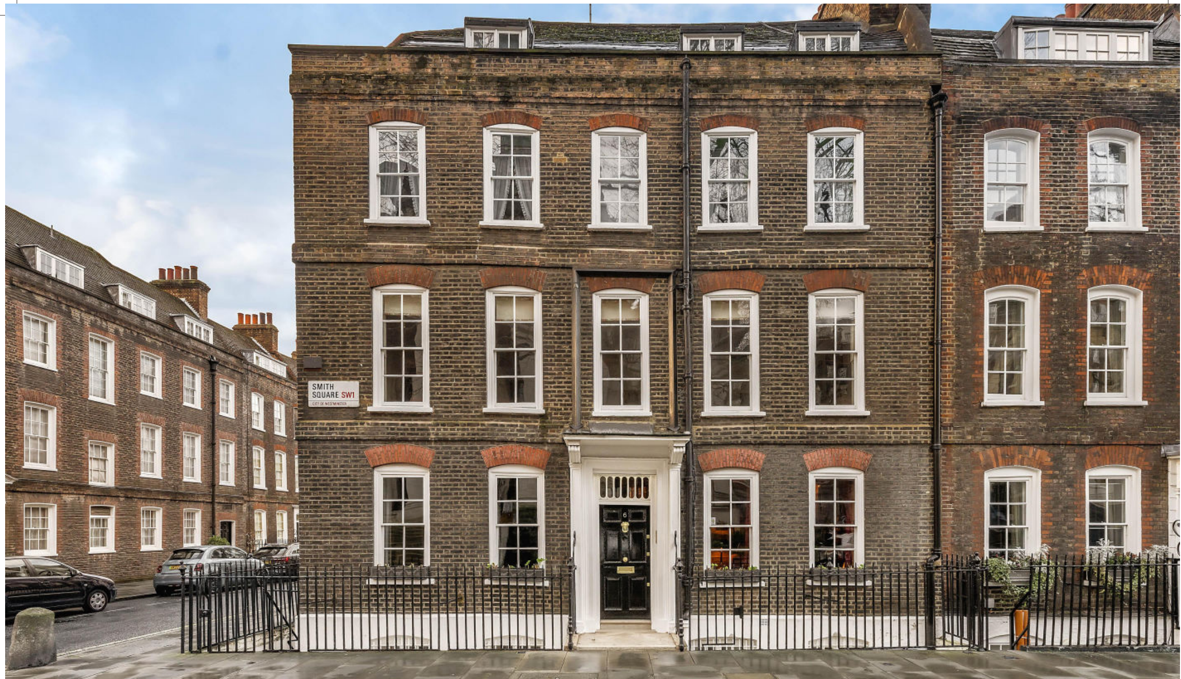
Smith Square, London SW1P