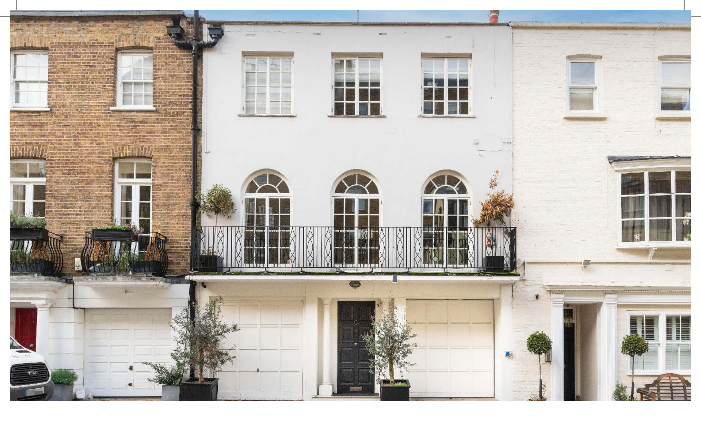
Boscobel Place, Belgravia, London SWIW