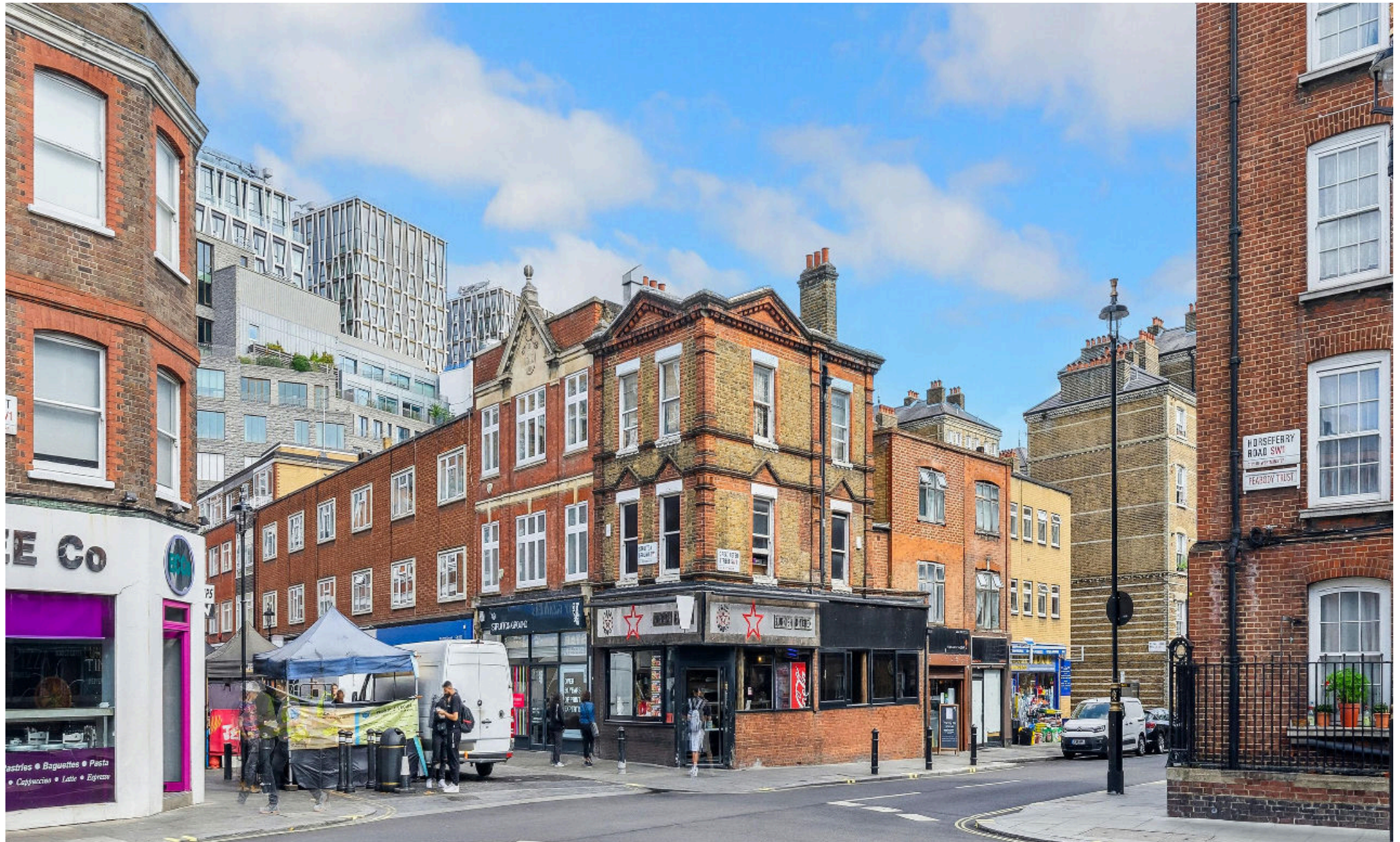
Strutton Court, Great Peter Street SWIP