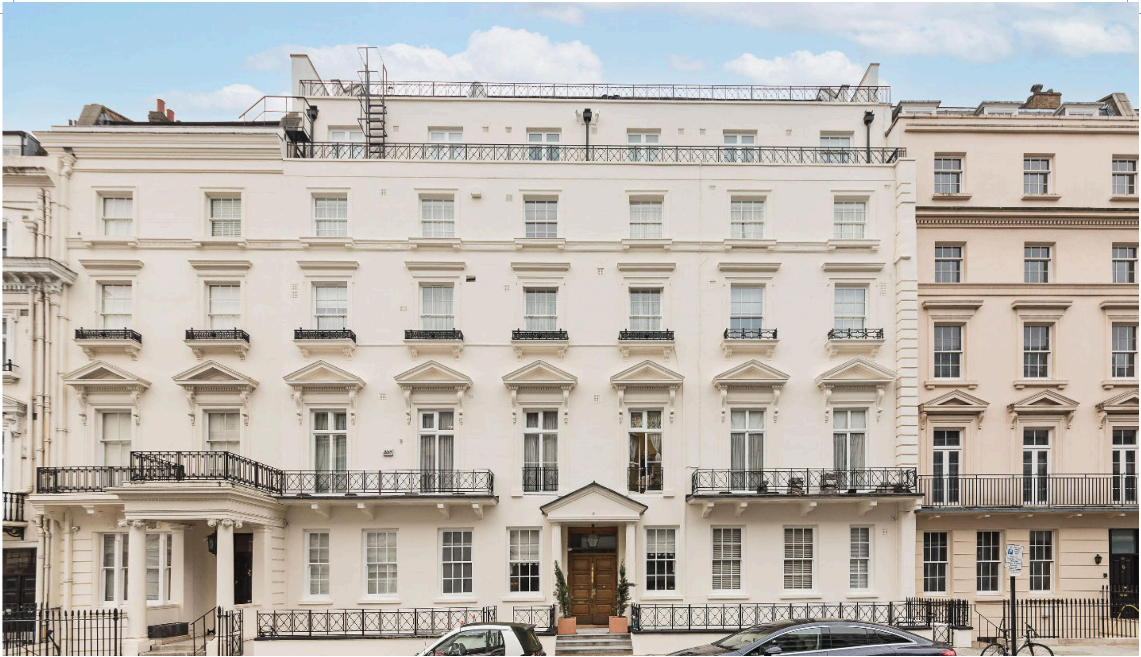
Carlton Lodge, Lowndes Street, London SW1X