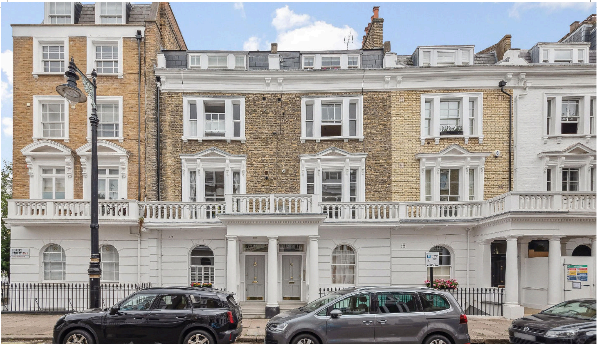
Sussex Street, London SW1V