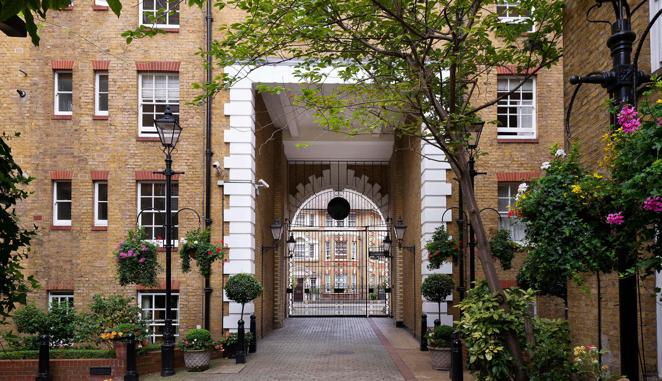
Gladstone Court, London SW1P