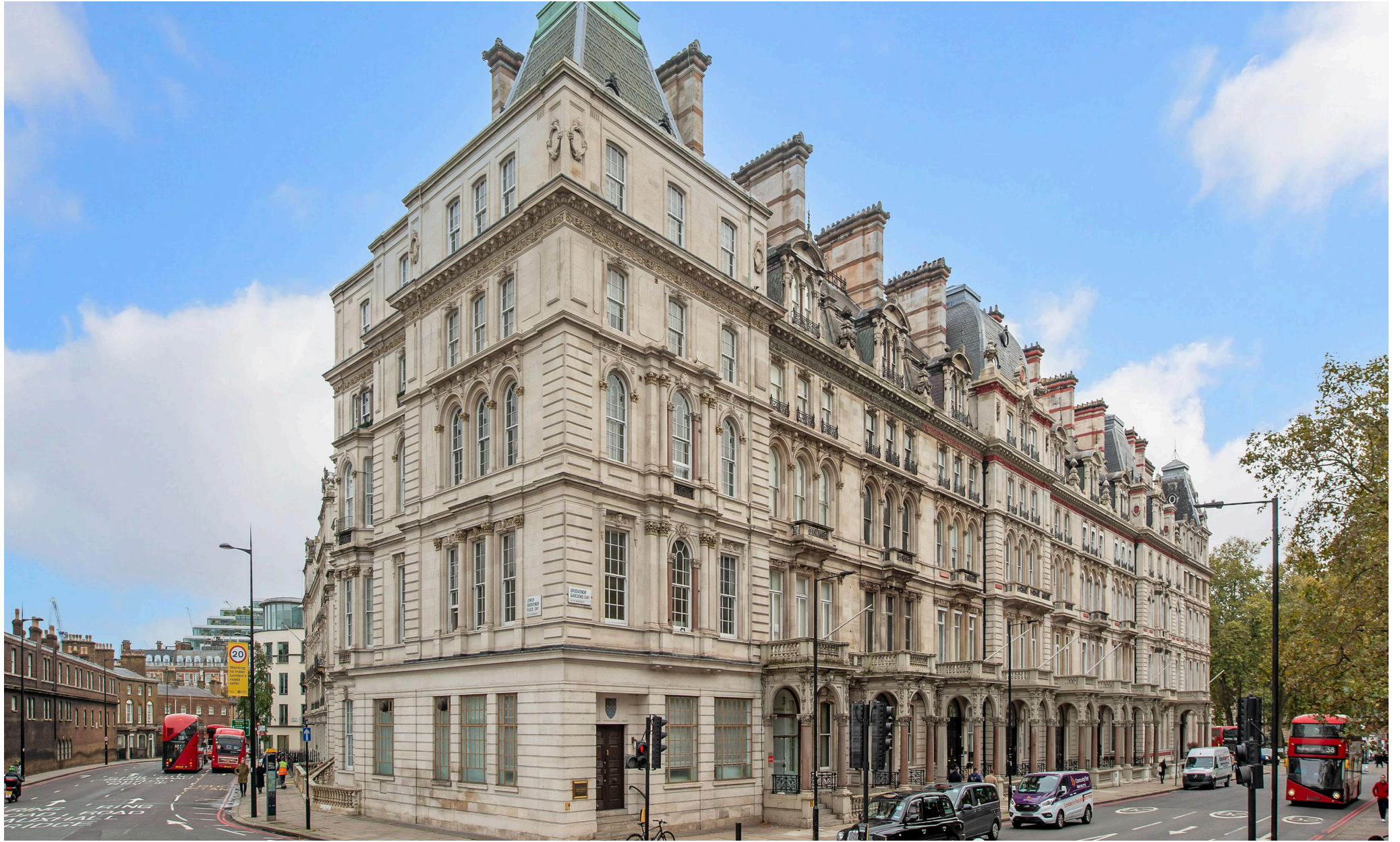
Grosvenor Gardens, Belgravia SW1W