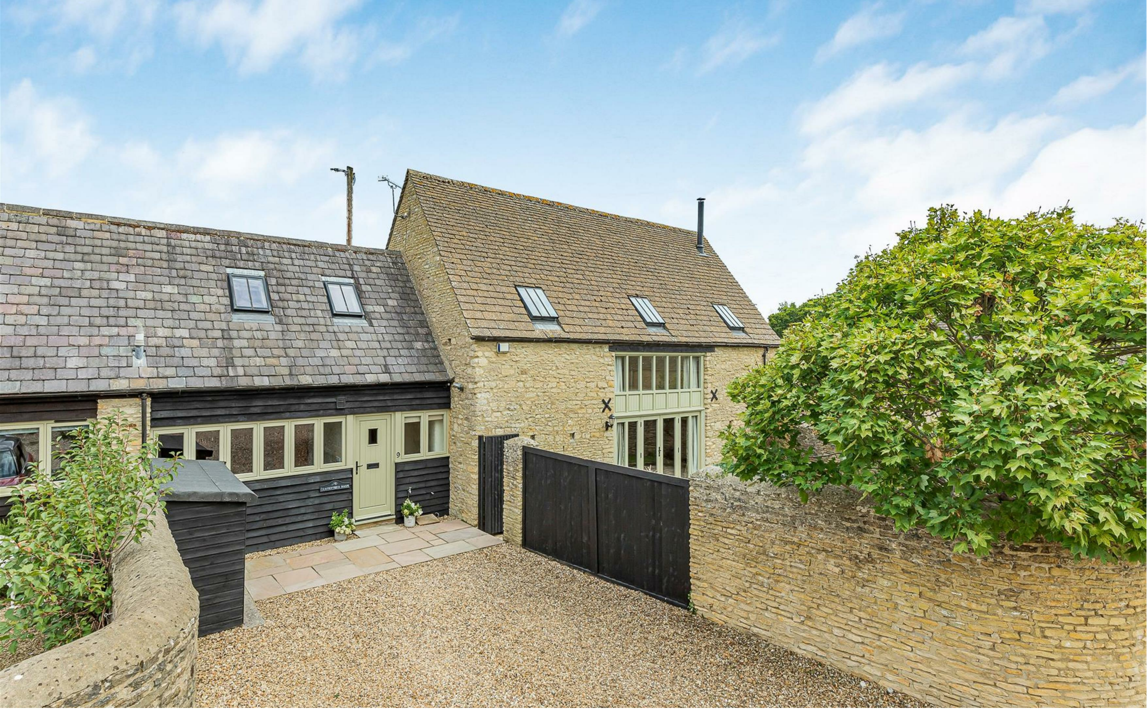
CARPENTER'S BARN, 9 BALL LANE, TACKLEY