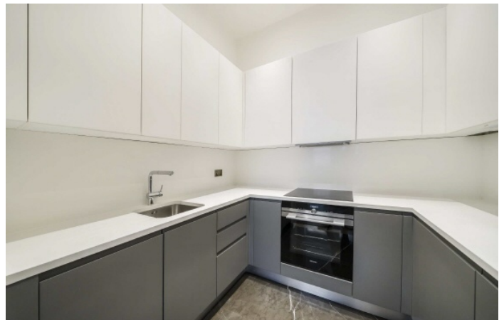
Kensington Court, W8