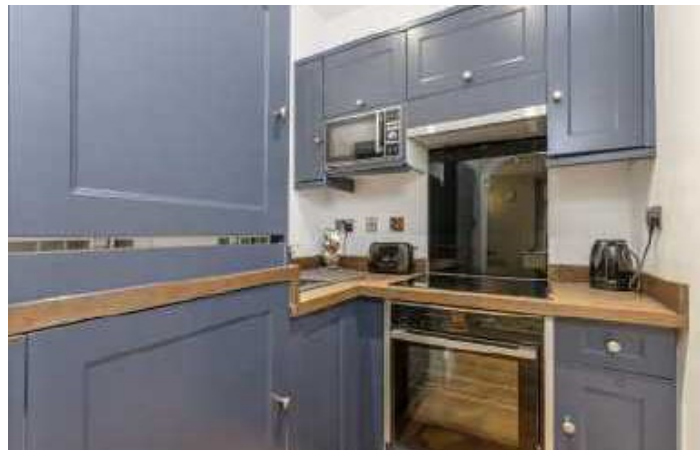
Mall Chambers, W8