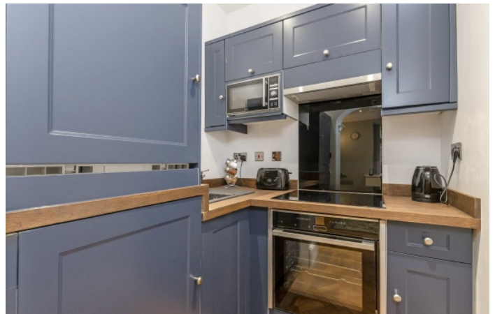
Mall Chambers, W8