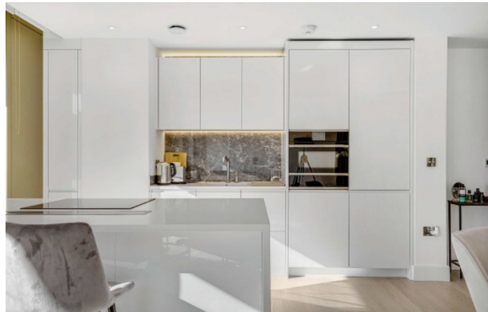
Warwick Lane, W14