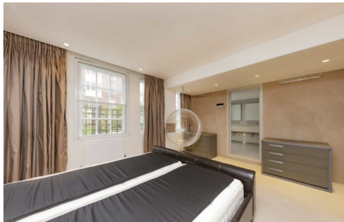
Whiteheads Grove, SW3