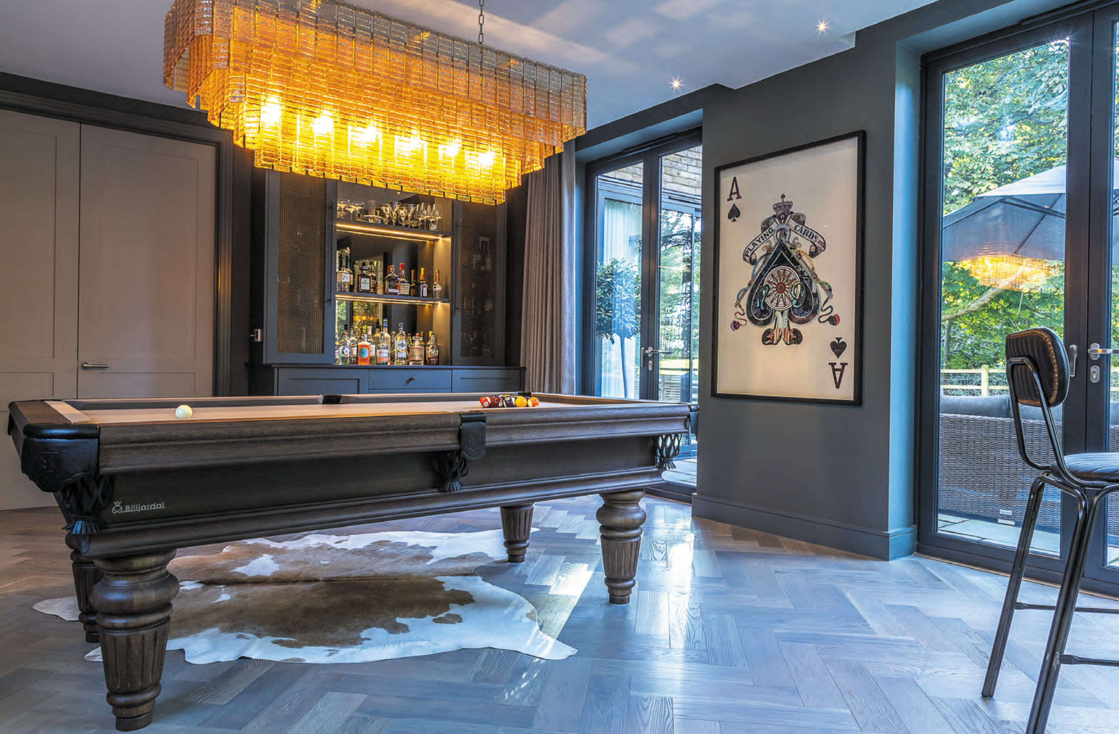
Family Reception / Games Room