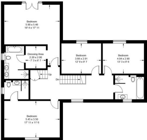
First Floor 1224 sq ft / 113.7 sq m