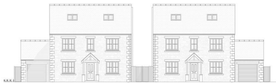
Street View of Plot 1 and Plot 2