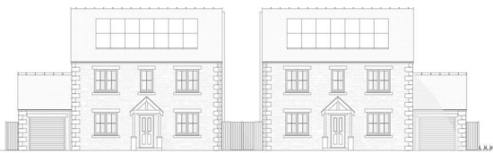
Street View of Plot 1 and Plot 3