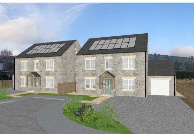
Land east of Longdale Grove, St Johns Chapel - Plot 3