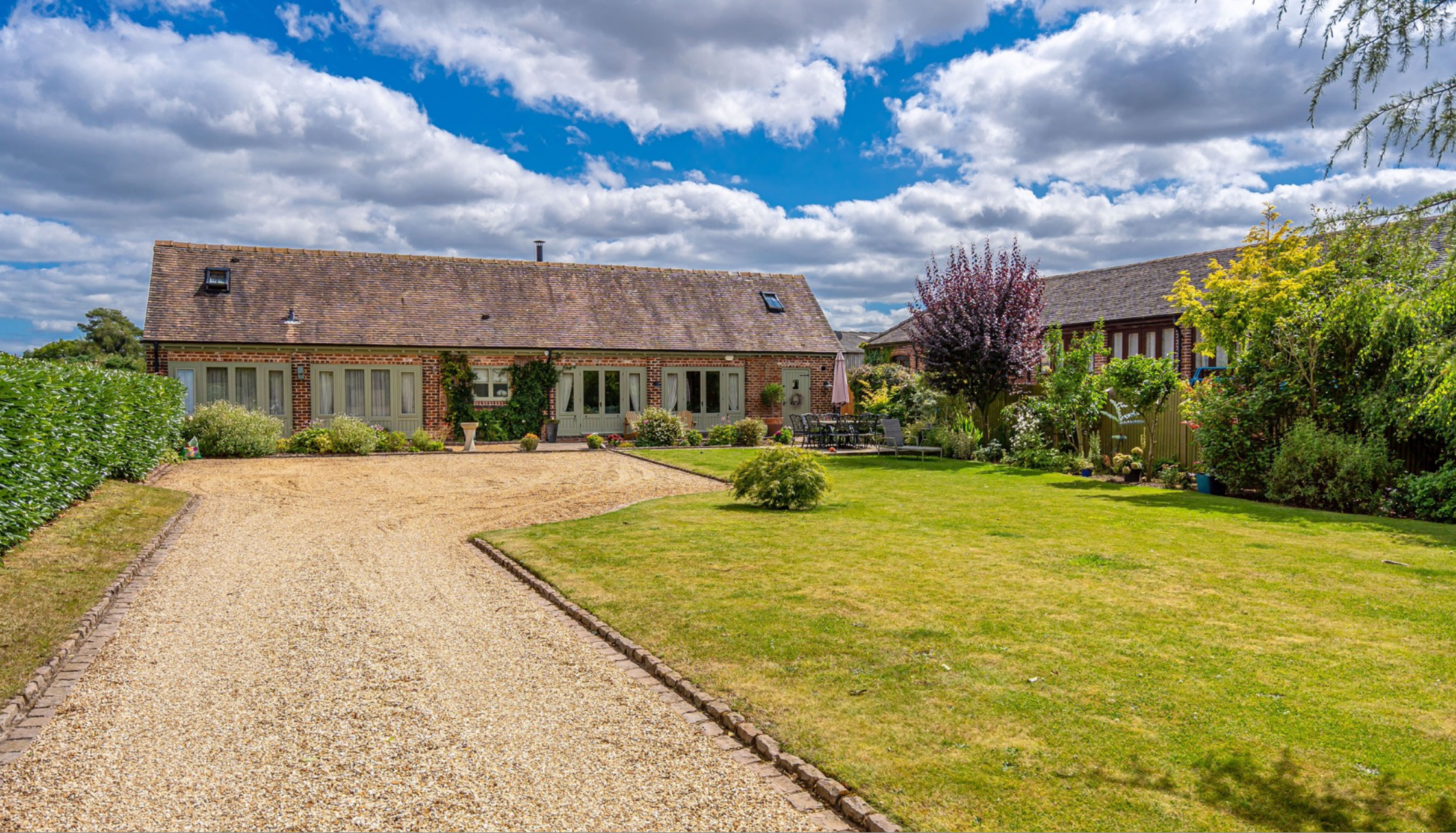
The Gatehouse, Burlington Court Shifnal, TF11 8BW