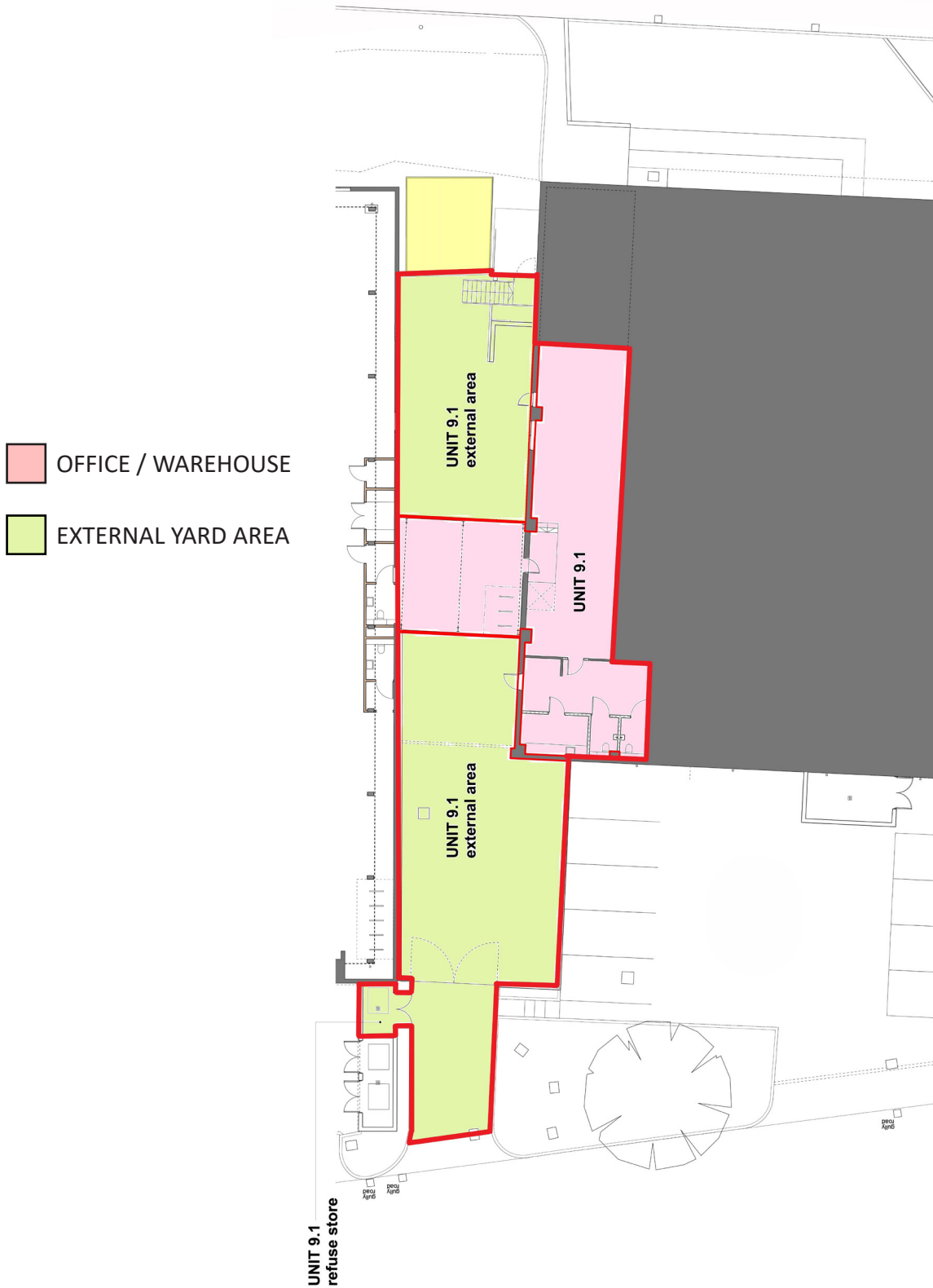
01: Building 9 Level 00 Plan