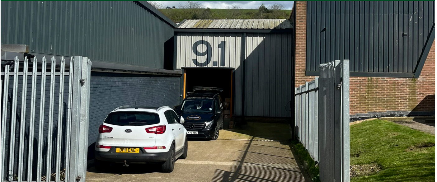
9.1 The Hyde, Brighton Works Auckland Drive, Brighton BN2 4JW