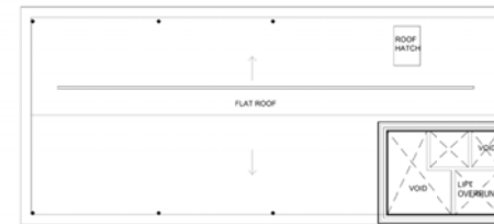
05 ROOF PLAN 1:200 @ A3