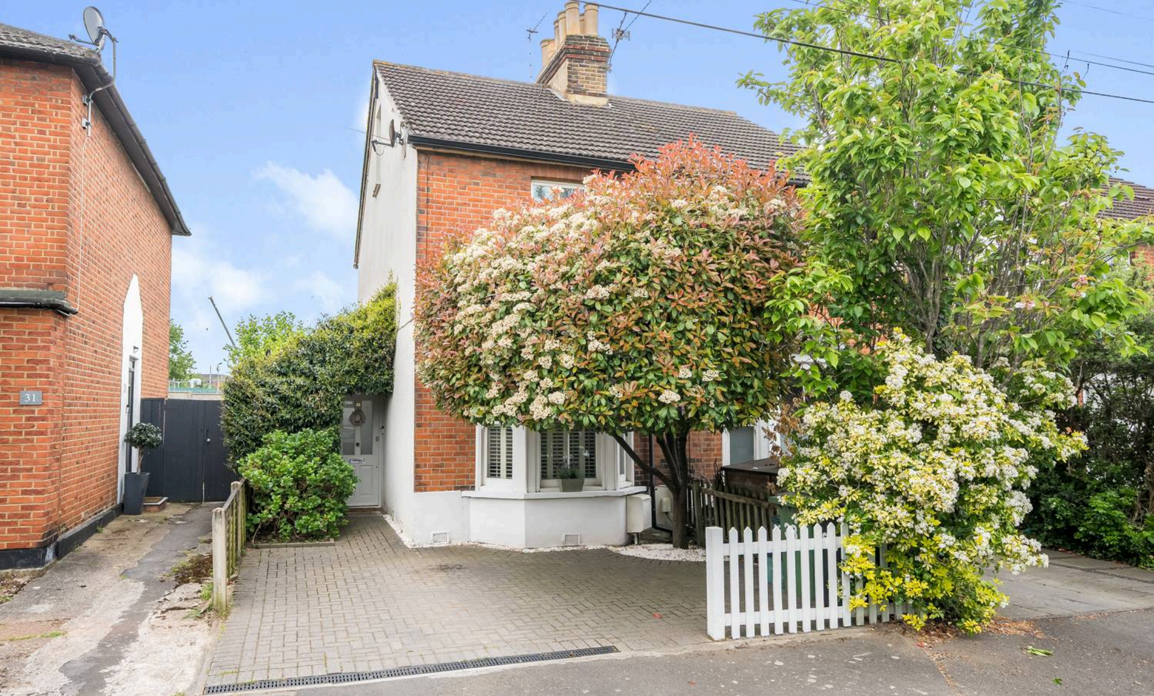
Victoria Place, Epsom