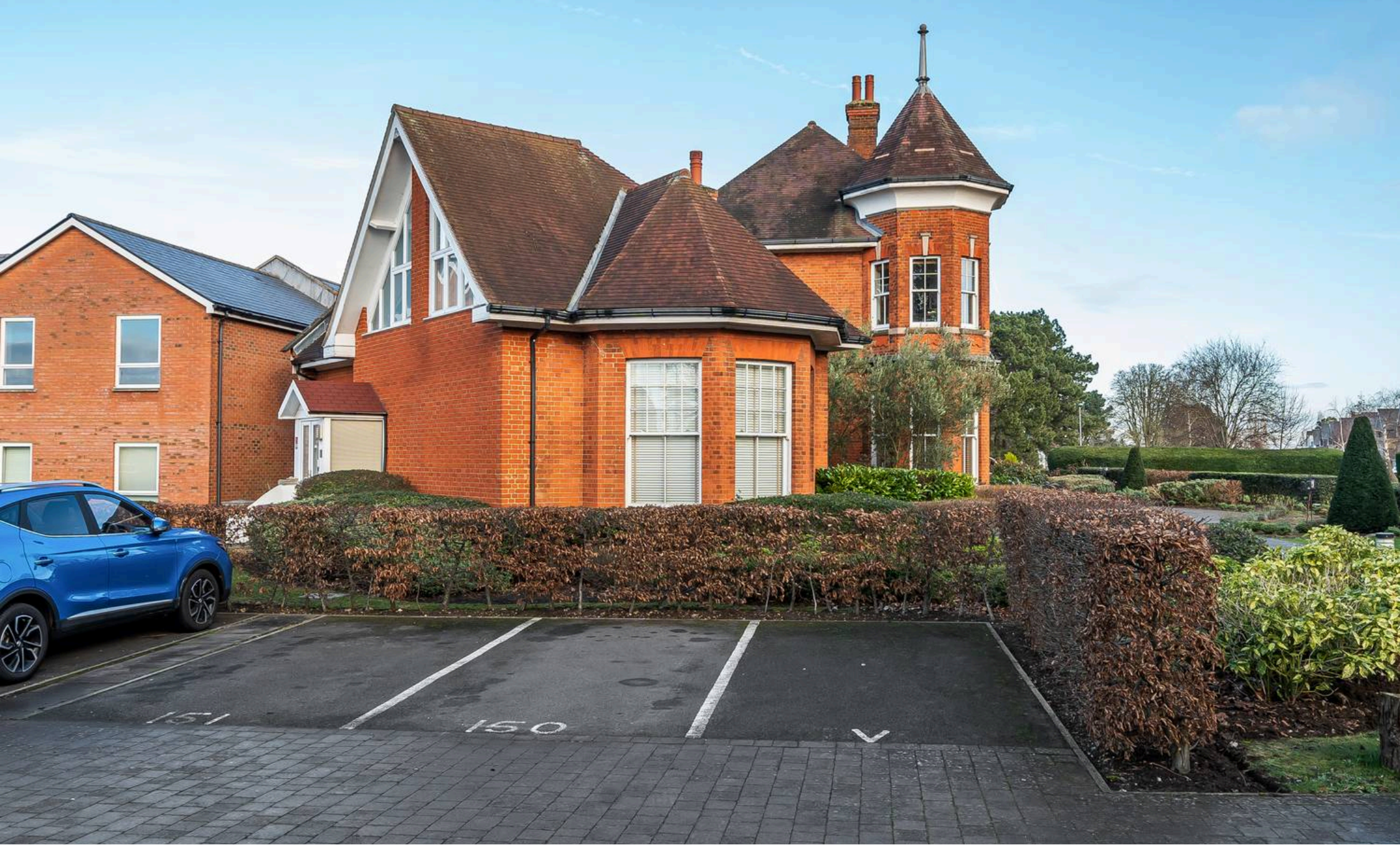
Cedar House, Parkview Way, Epsom