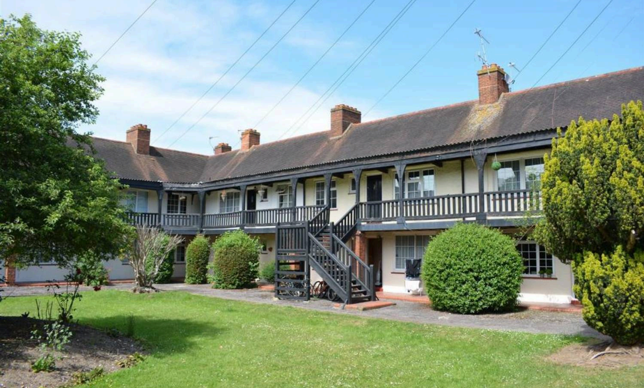
Court Farm Gardens, Manor Green Road, Epsom