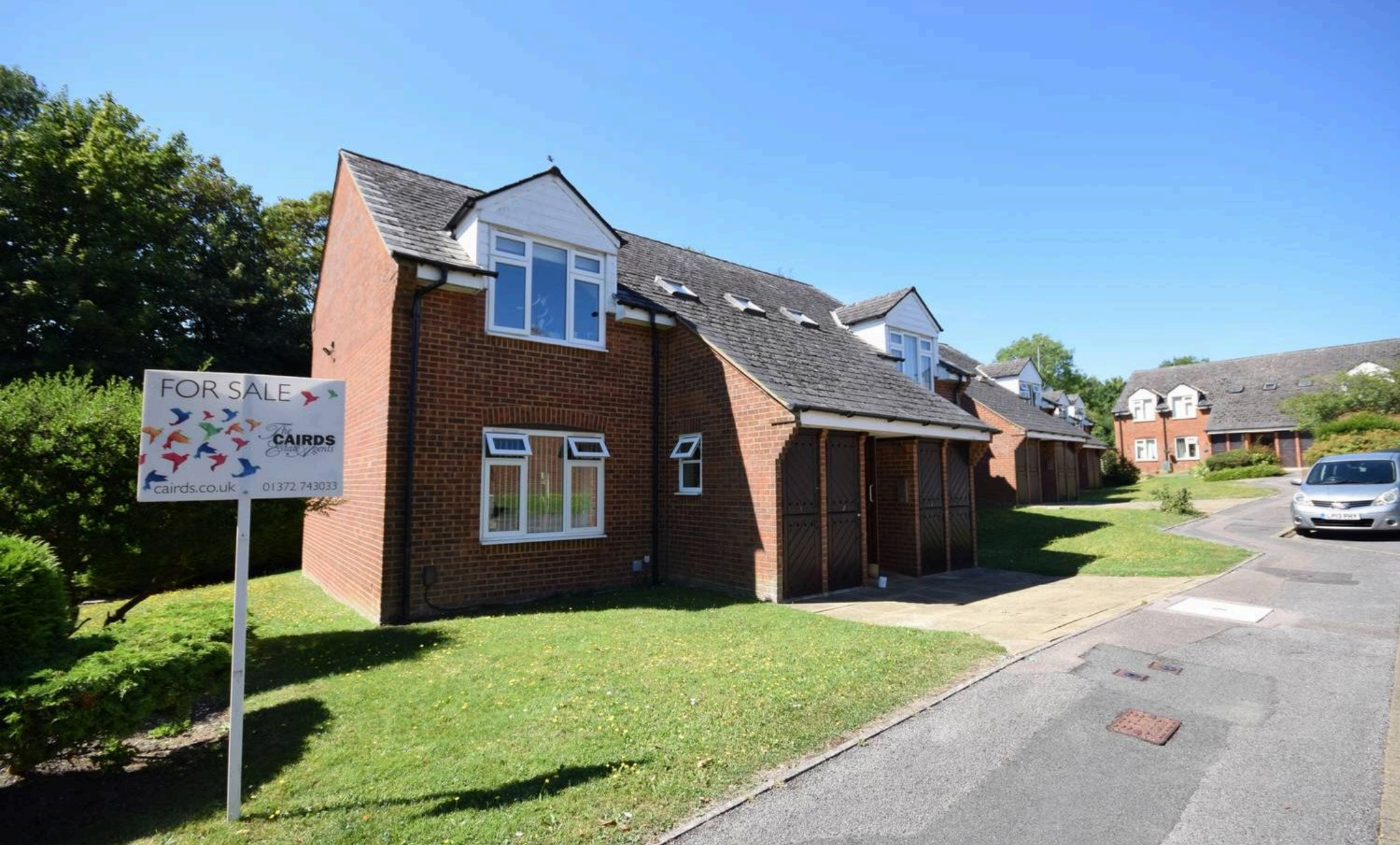
Flat 1, Rowan Mead Henbit Close, Tadworth Tadworth