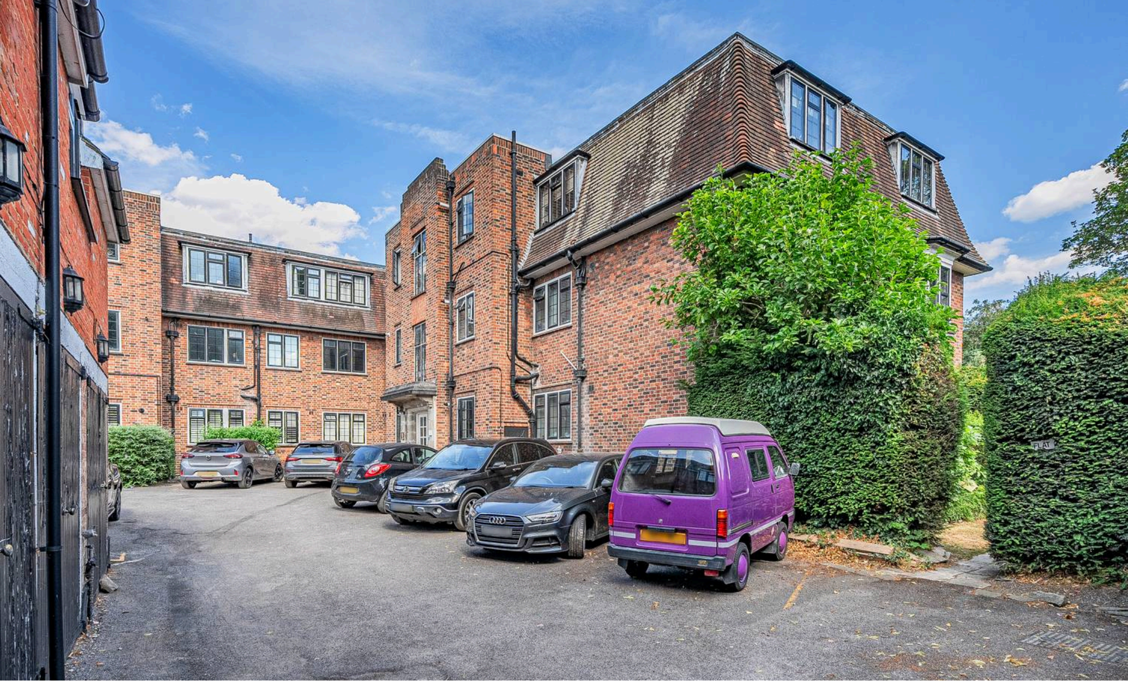
Church Close, Church Street, Epsom