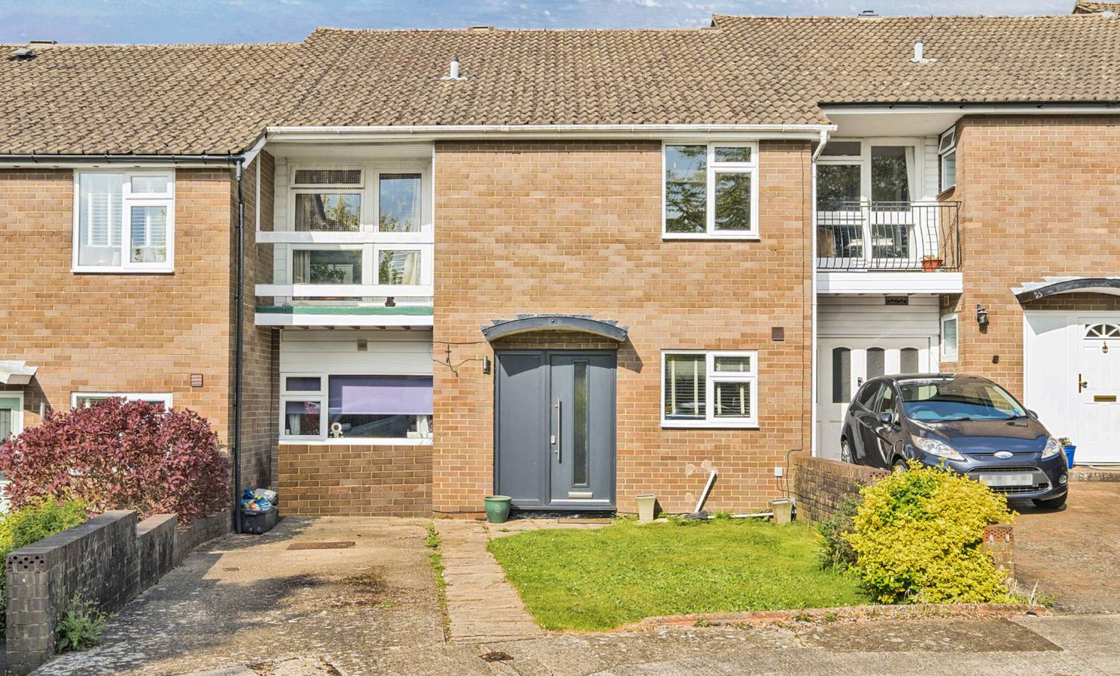
Harkness Close, Epsom