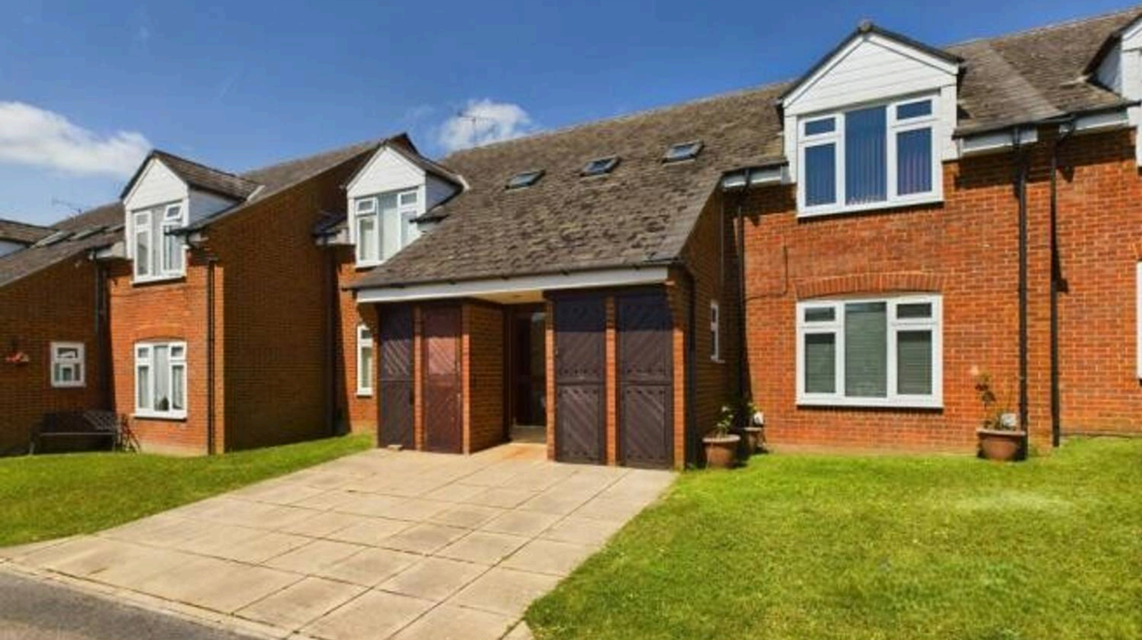
Rowan Mead, Henbit Close, Tadworth