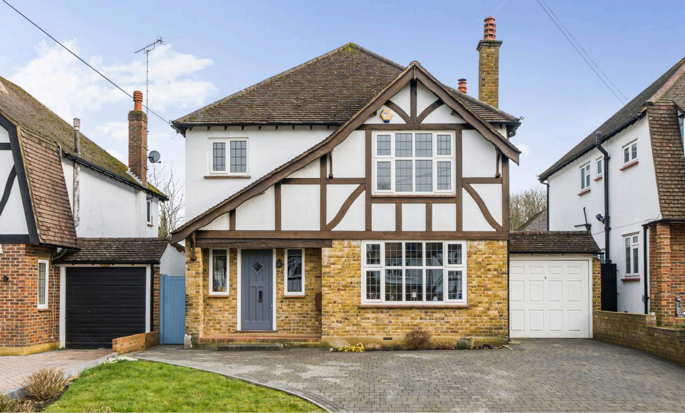
Chantry Hurst, Epsom