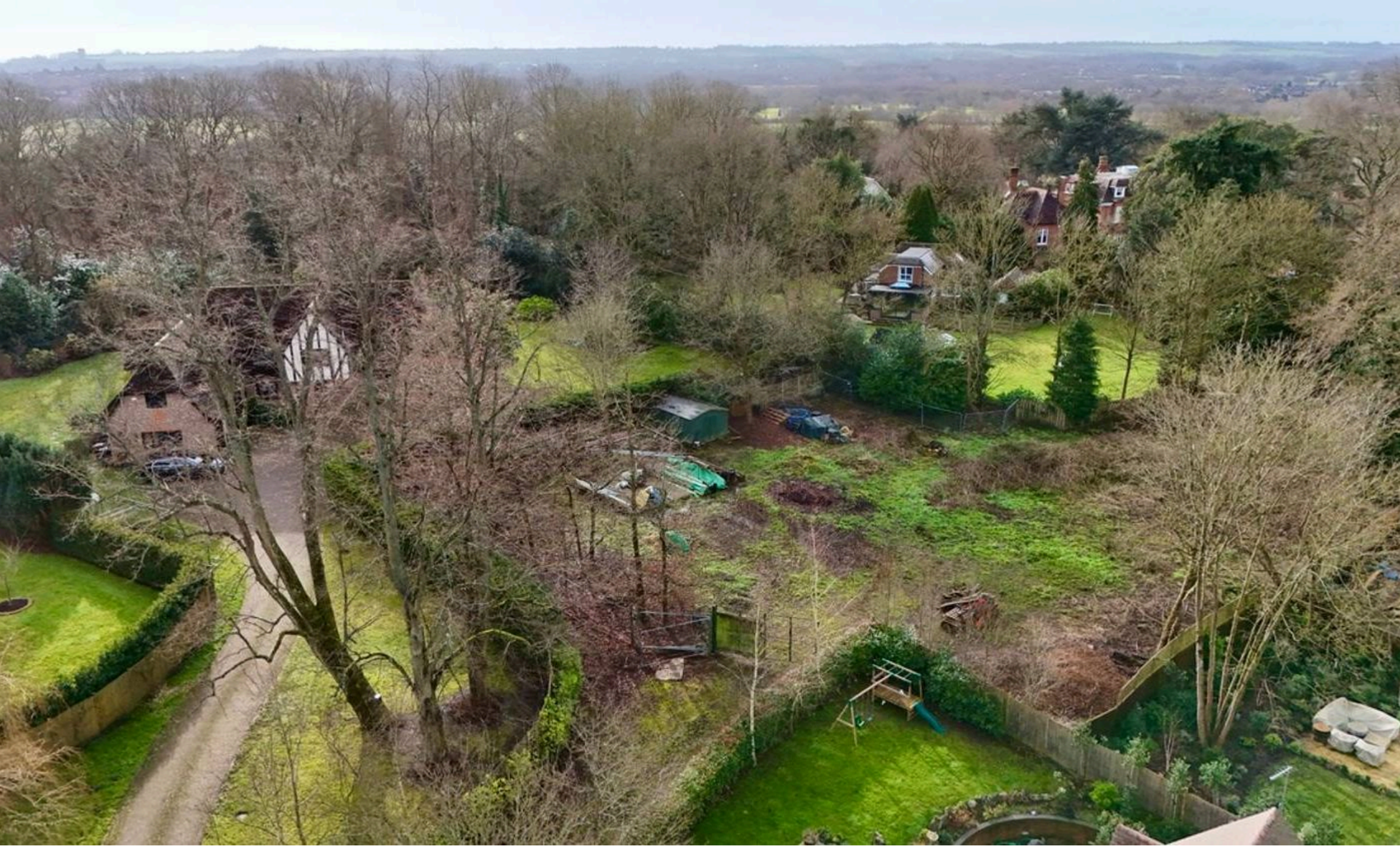
Land on the south side of St Marys Gardens, Perry Hill, Guildford