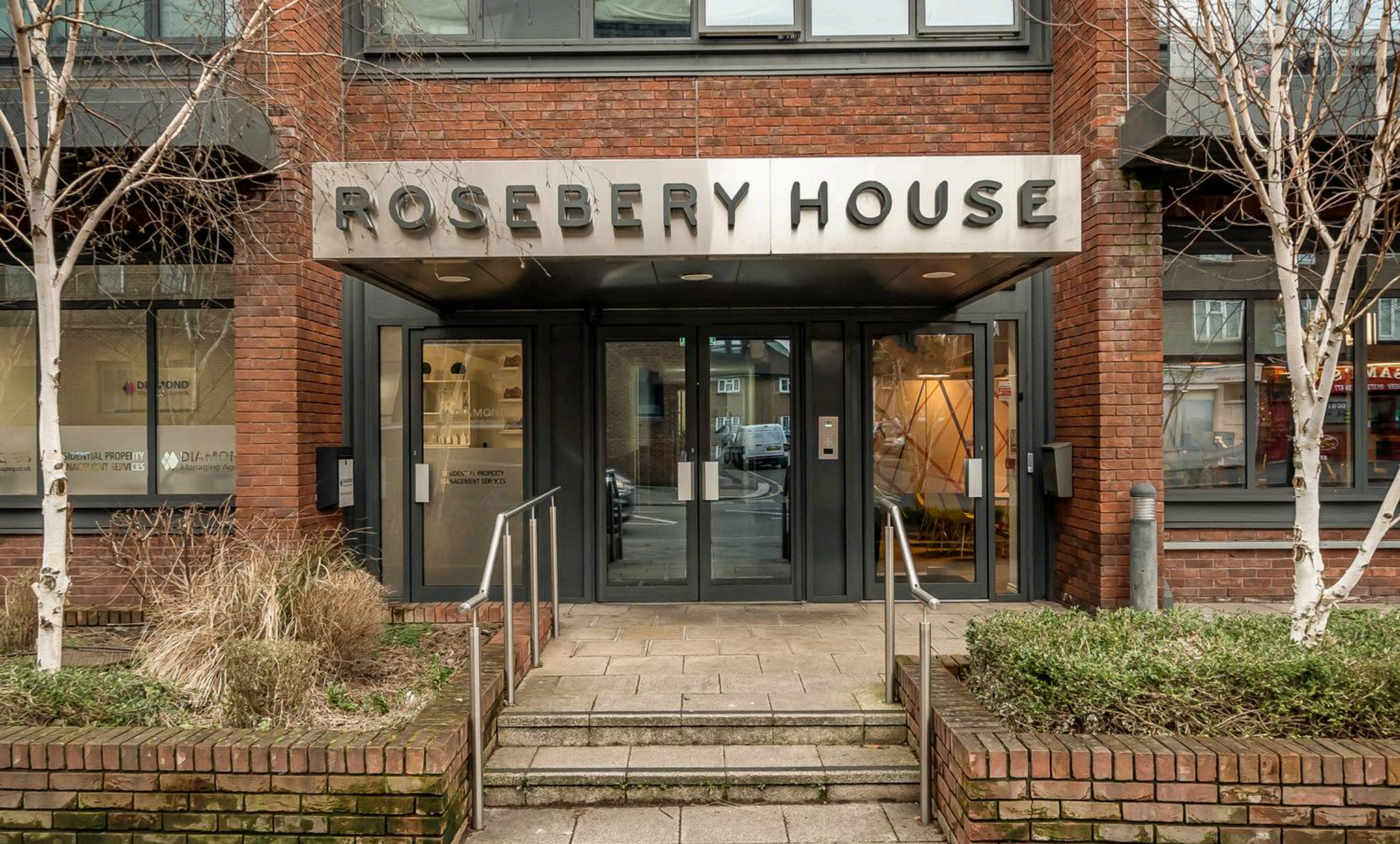
Rosebery House, 57 East Street Epsom