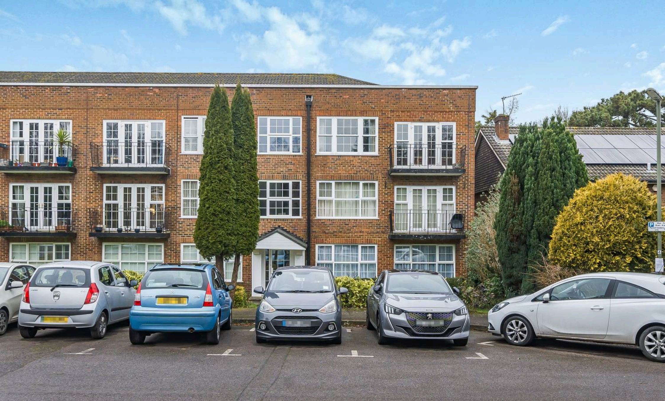
Highridge Court, Highridge Close, Epsom