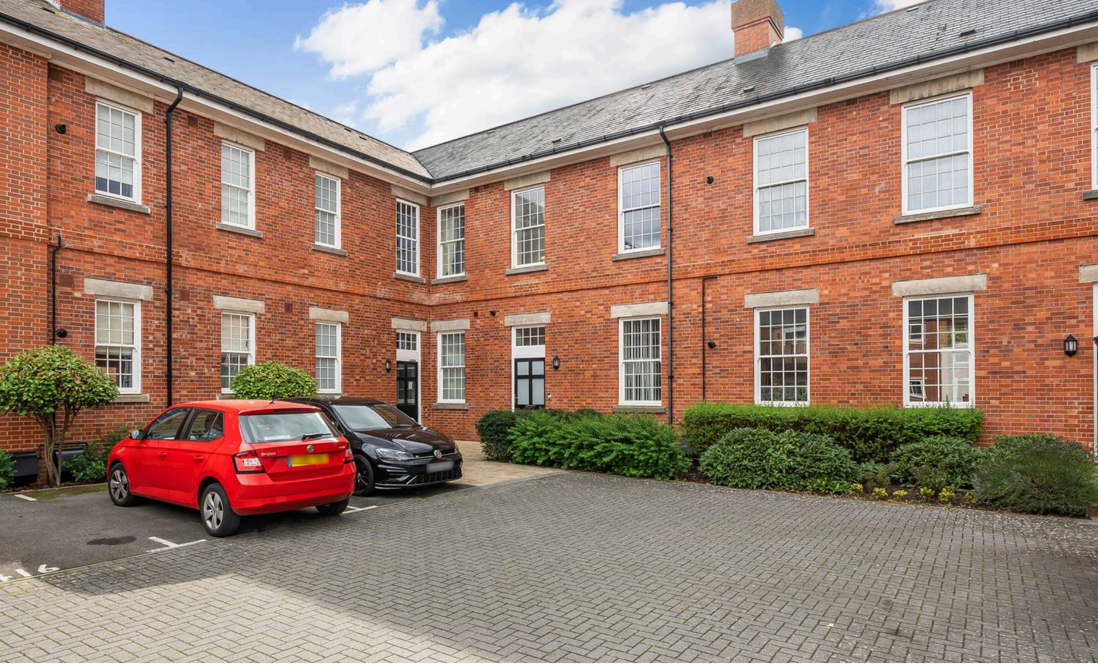
Ashford Court, Glanville Way, Epsom