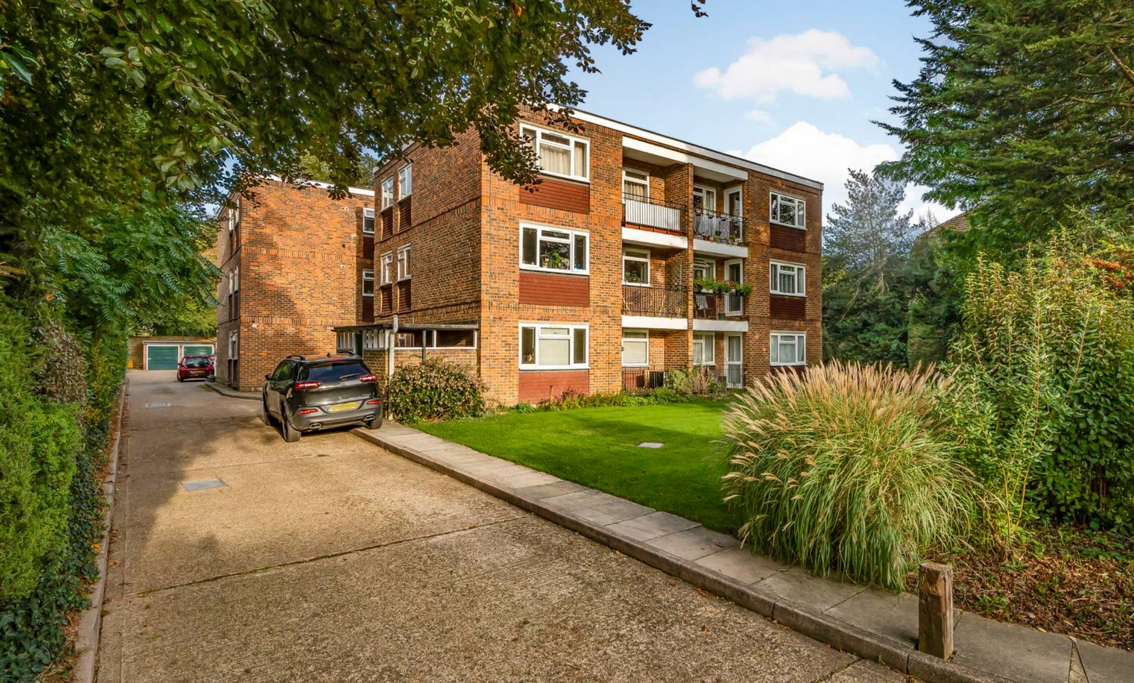
10 Clovelly Court Alexandra Road, Epsom Epsom