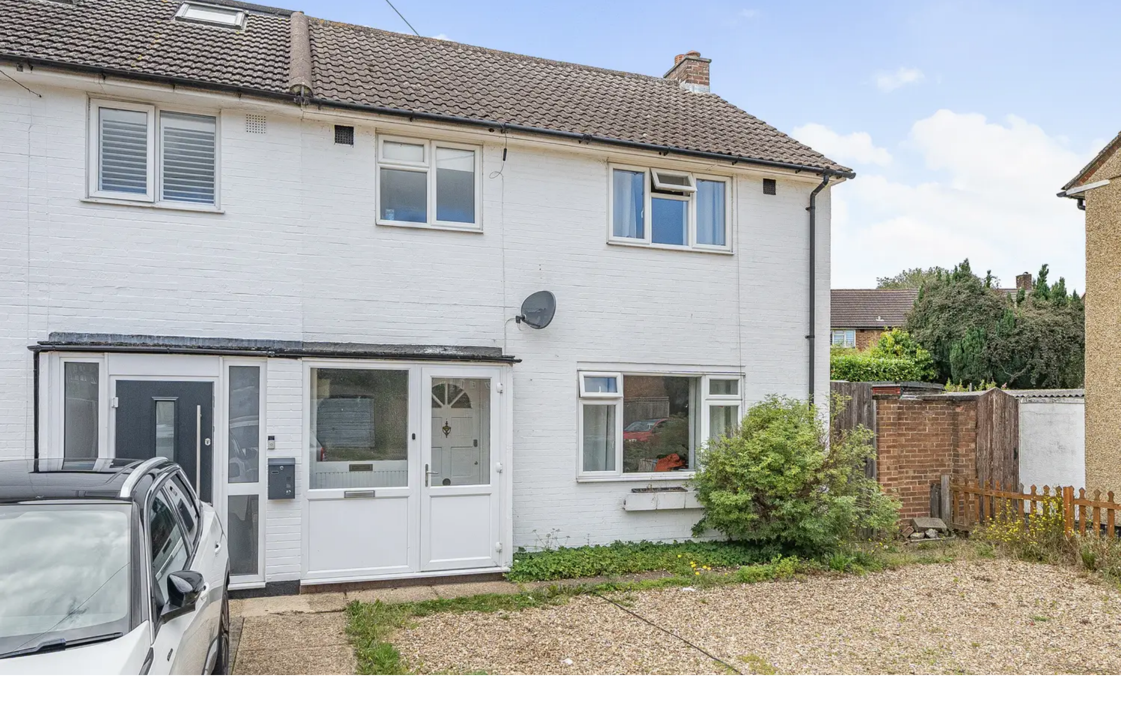
7 Homefield Gardens, Tadworth