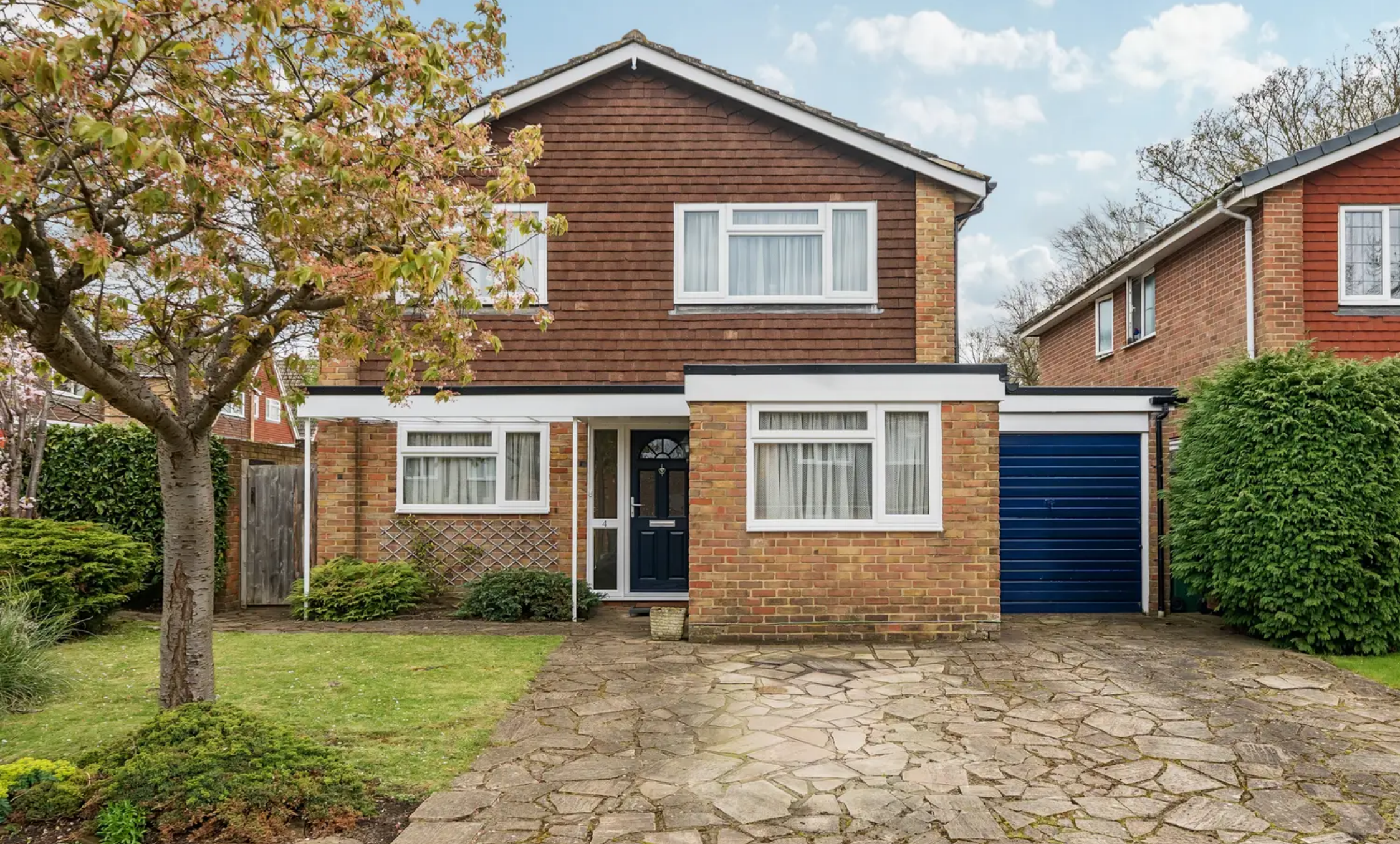
4 High Beeches, Banstead Banstead