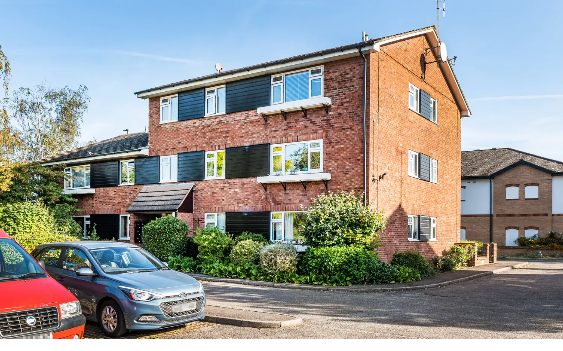
15 The Stanfords East Street, Epsom