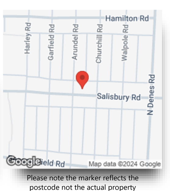
view this property online williamhbrown.co.uk/Property/GTY108651