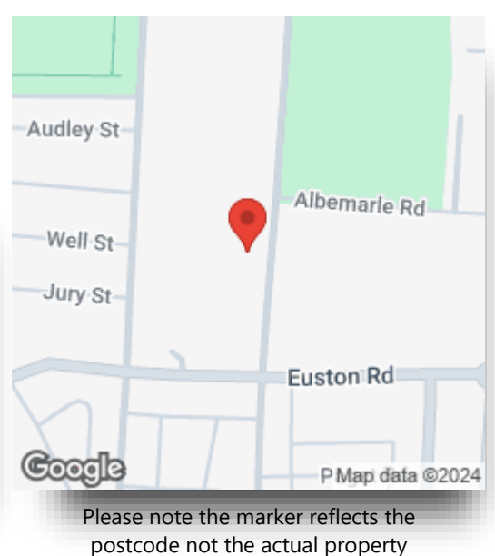
view this property online williamhbrown.co.uk/Property/GTY108292