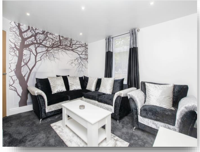
End House Winterton Road, Hemsby Great Yarmouth NR29 4HH