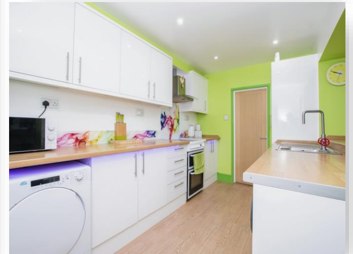
End House Winterton Road, Hemsby Great Yarmouth NR29 4HH