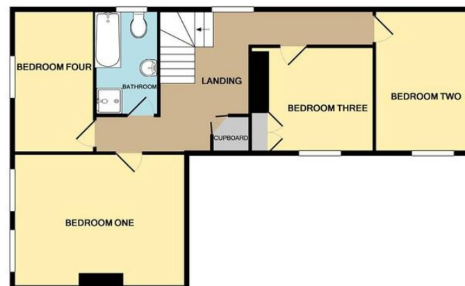
1ST FLOOR APPROX. FLOOR AREA 785 SQ.FT. (73.0 SQ.M.)