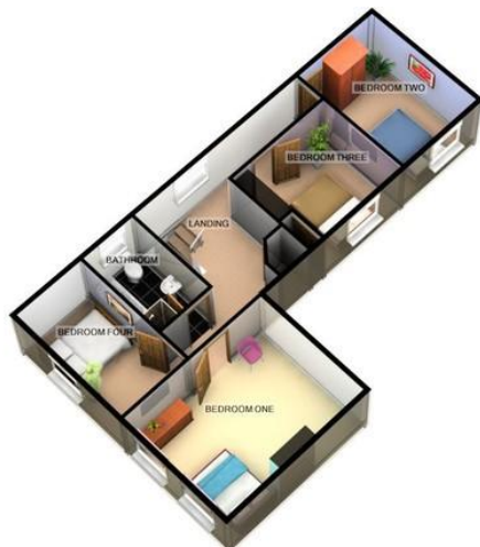
1ST FLOOR APPROX. FLOOR AREA 785 SQ.FT. (73.0 SQ.M.)