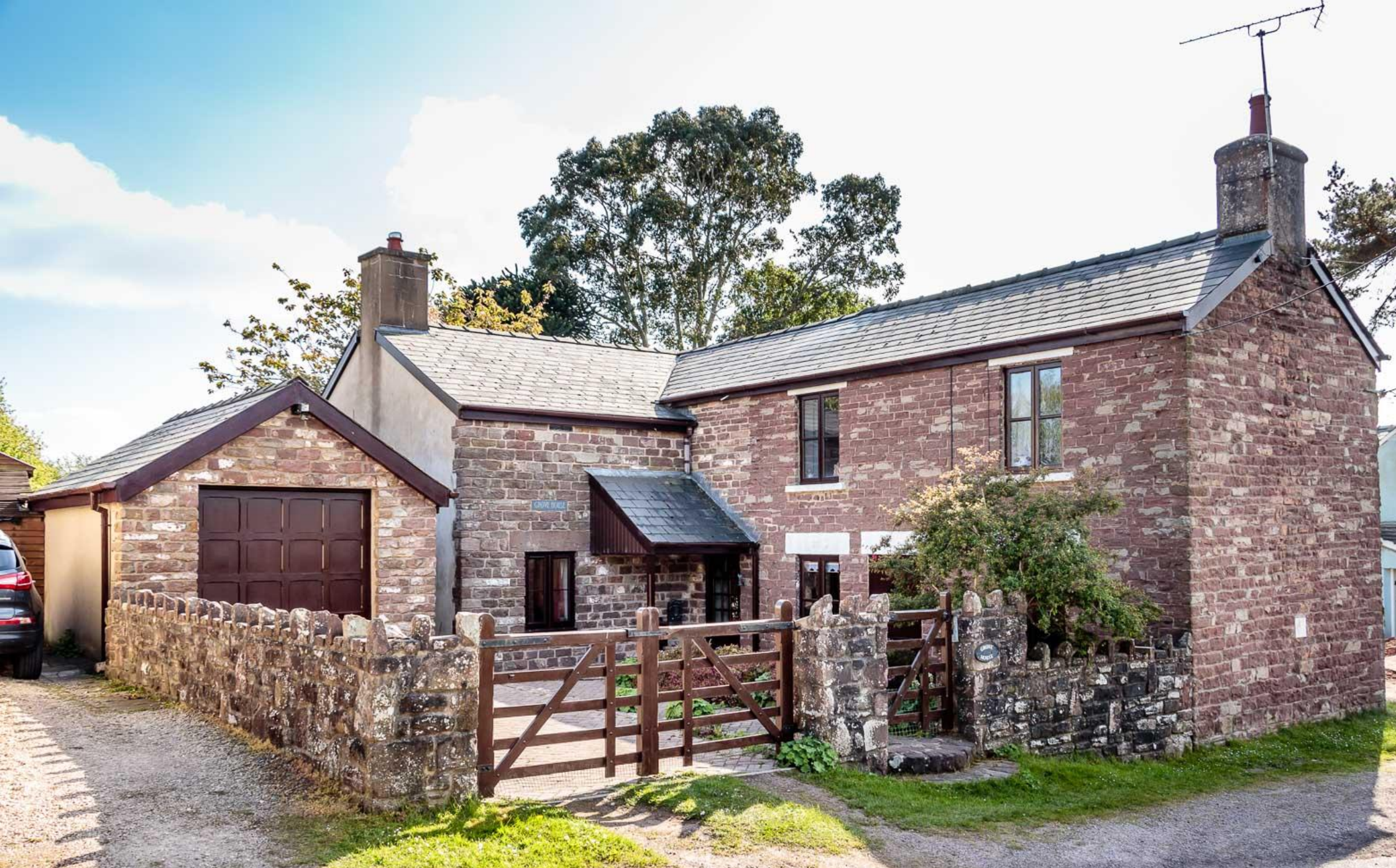
Pine Tree Way, Viney Hill GL15 4NT | £399,999 4 Bedroom Detached Cottage