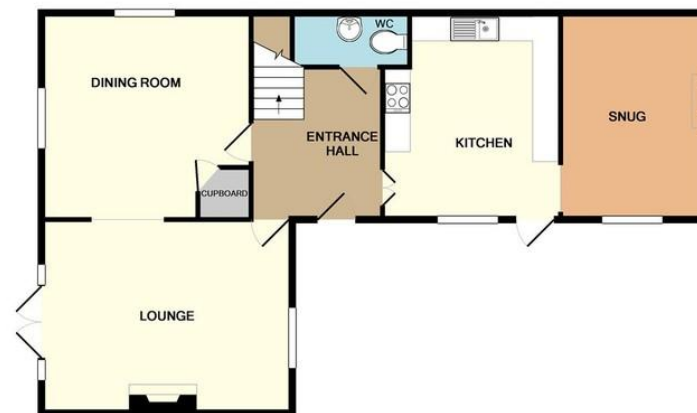
GROUND FLOOR APPROX. FLOOR AREA 1172 SQ.FT. (108.9 SQ.M.)