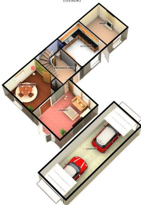
GROUND FLOOR APPROX. FLOOR AREA 1172 SQ.FT. (108.9 SQ.M.) PINE TREE WAY, VINEY HILL, GL15 4NT TOTAL APPROX. FLOOR AREA 1957 SQ.FT. (181.8 SQ.M.)