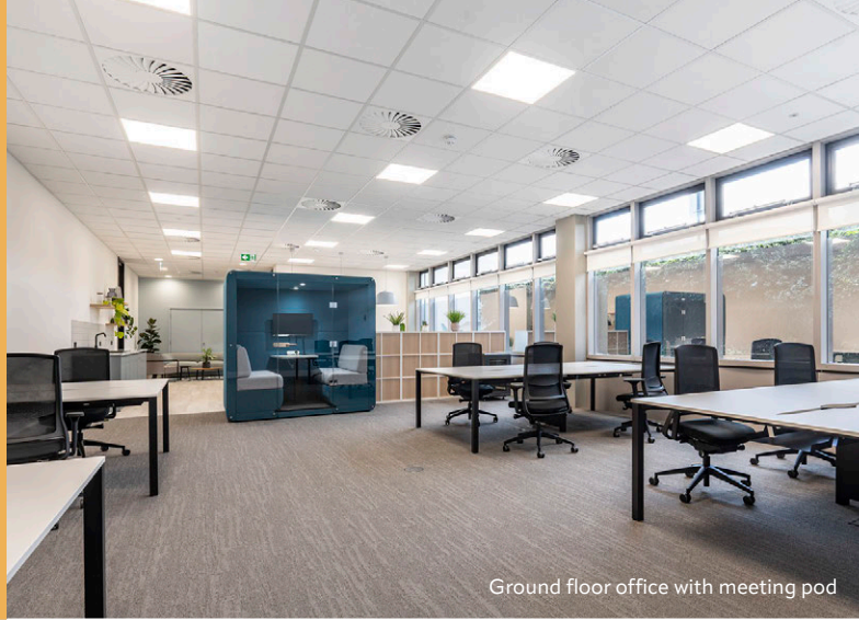
Ground floor office with meeting pod