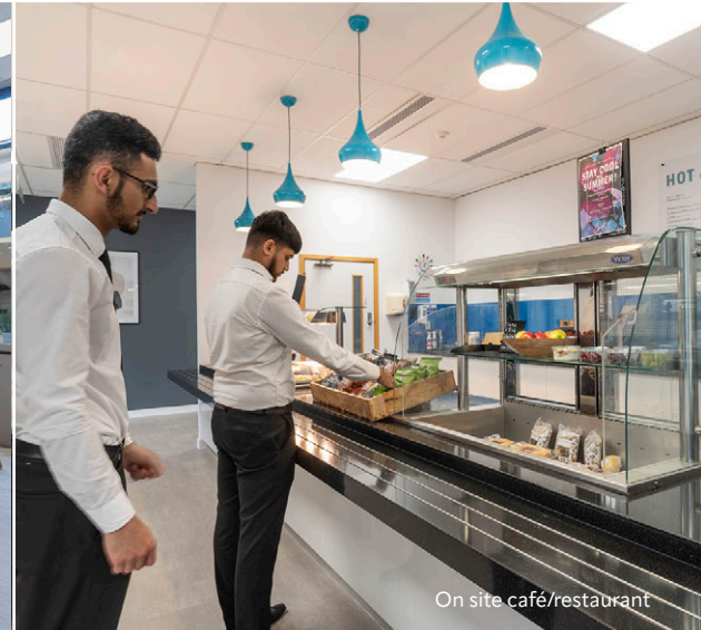
On site café/restaurant