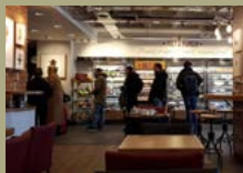
Pret Station Hill