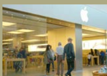
Apple Store at The Oracle