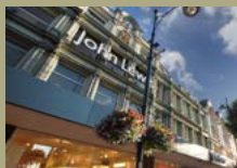
John Lewis Broad Street