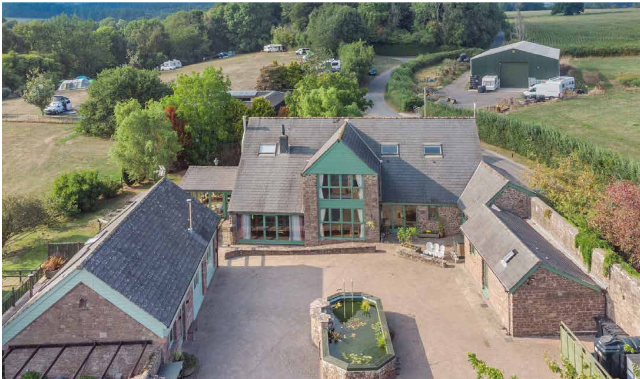
Beanhill Barn Alvington | Lydney | Gloucestershire | GL15 6AE