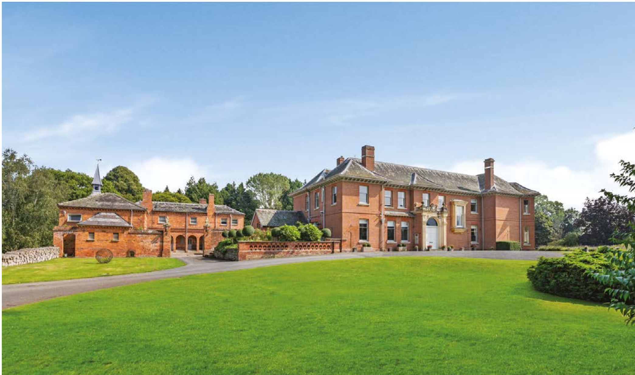
Letton Court Letton | Hereford | Herefordshire | HR3 6DH