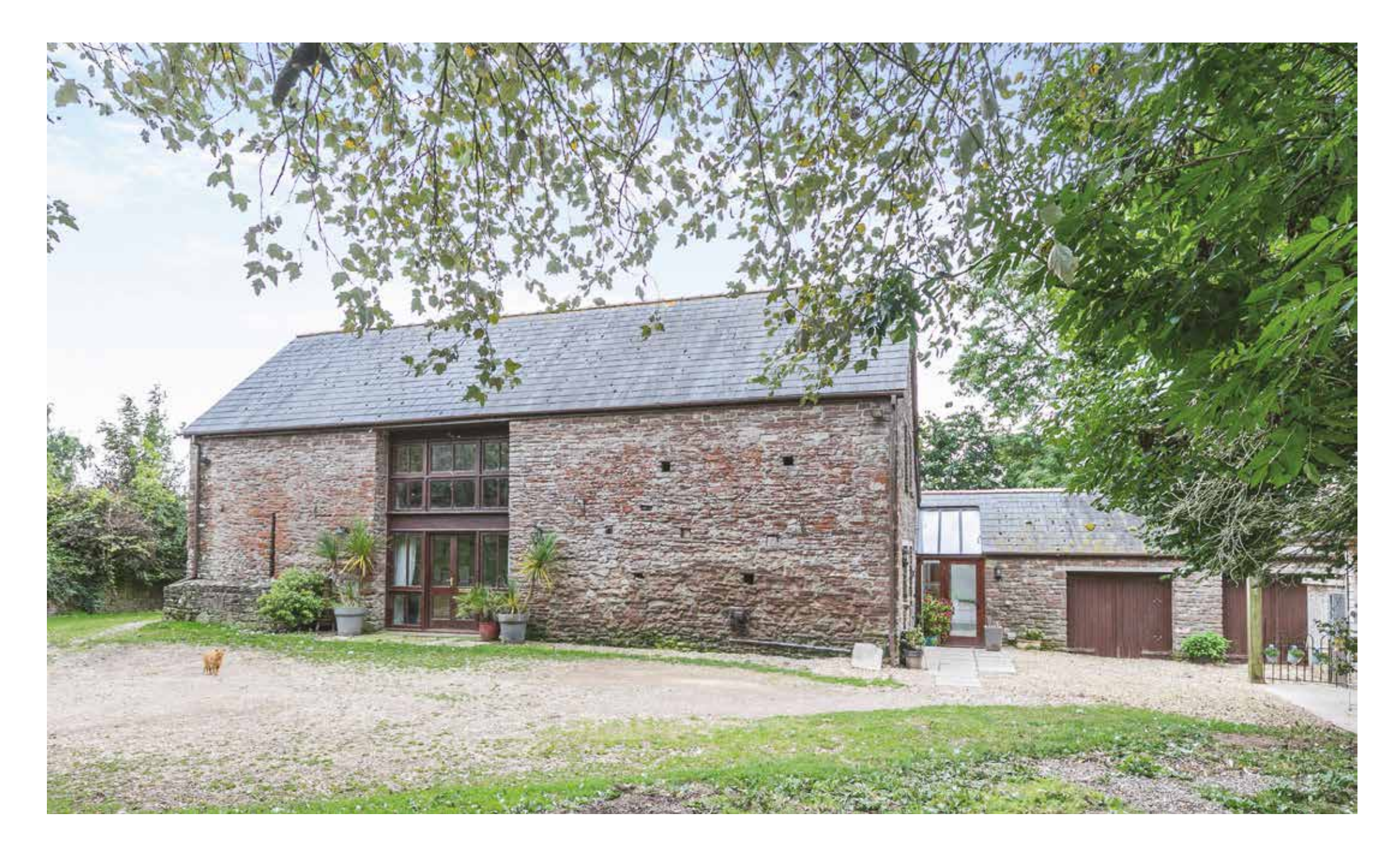
Old Street Barn Lensbrook | Lydney | Gloucestershire | GL15 4LR