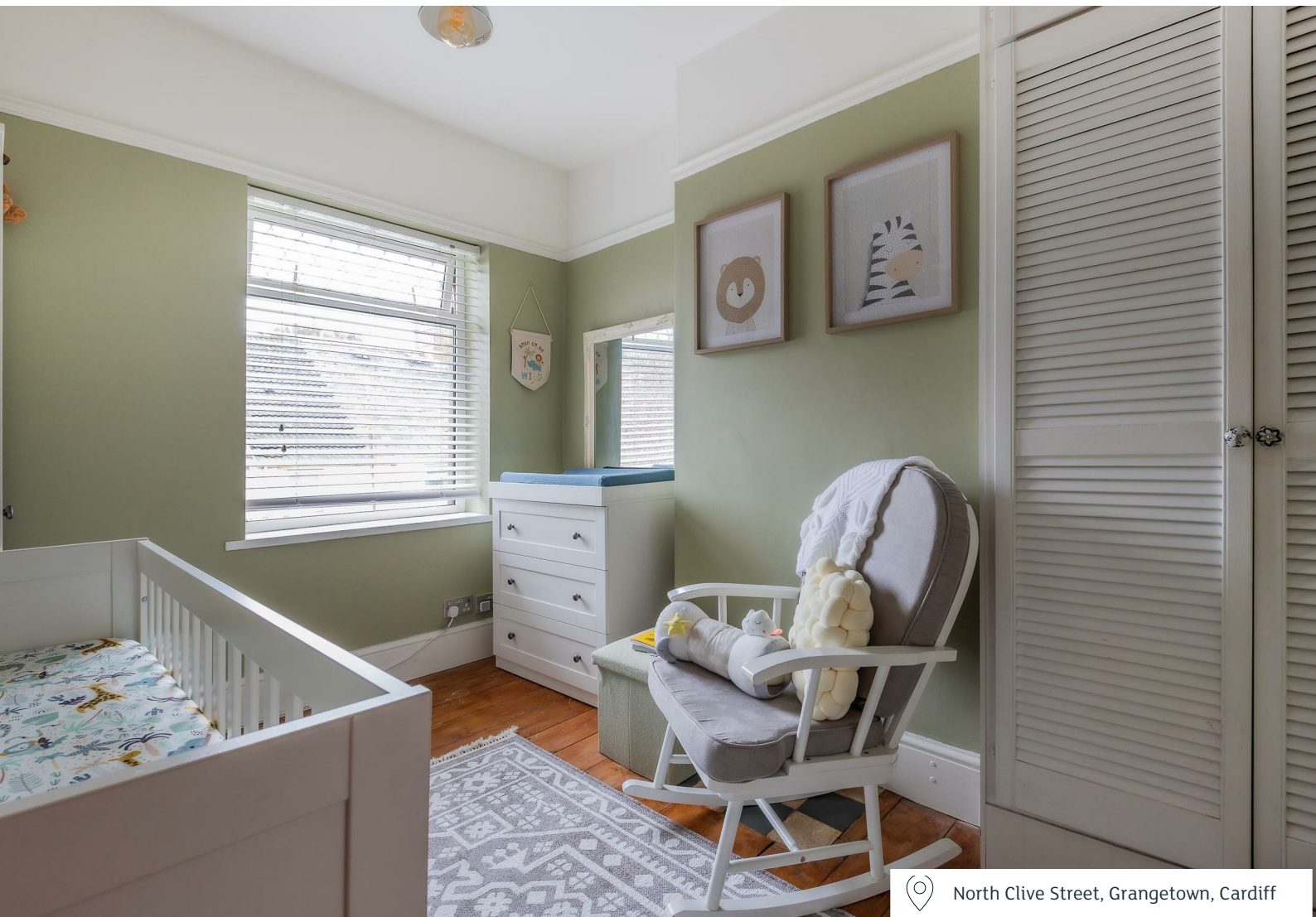
North Clive Street, Grangetown, Cardiff