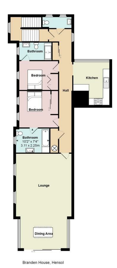
Total\ Area:\ 1277\ ft^2\ ...\ 118.7\ m^2 All measurements are approximate and for display purposes only