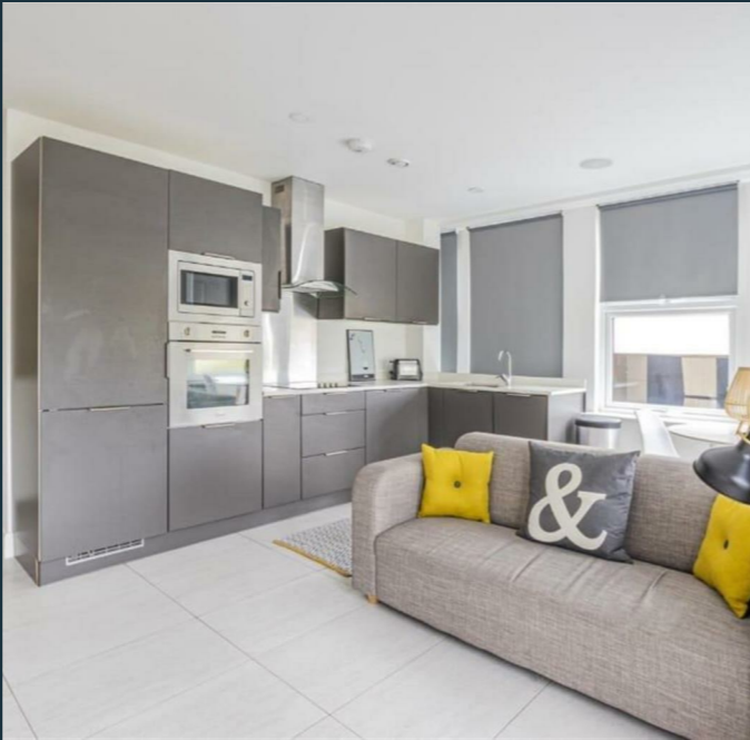
Cathedral Parc, Cardiff CF11