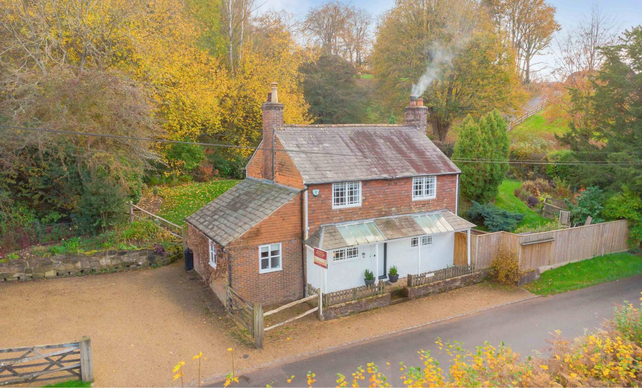
The Cottage, Tidebrook, Wadhurst, East Sussex, TN5 6PA