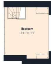
Floor 3 Building 1